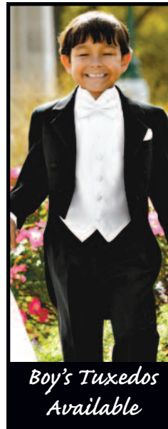
Boy's Tuxedos Available