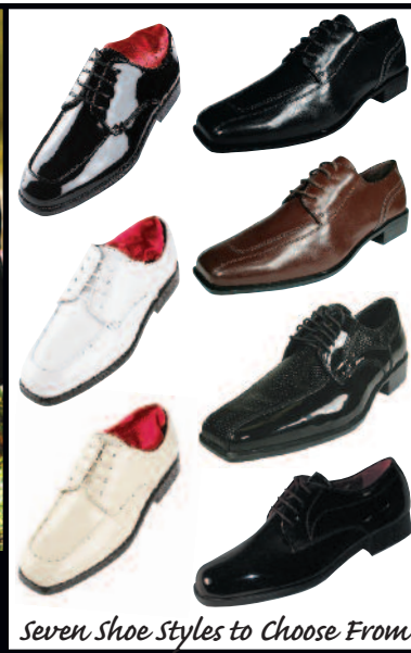
Seven Shoe Styles to Choose From