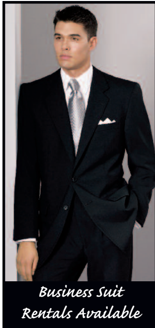
Business Suit Rentals Available