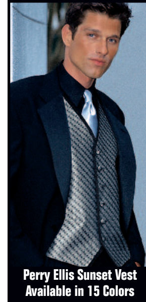
Perry Ellis Sunset Vest Available in 15 Colors