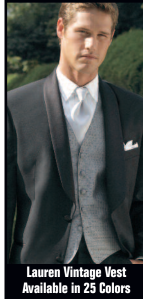
Lauren Vintage Vest Available in 25 Colors