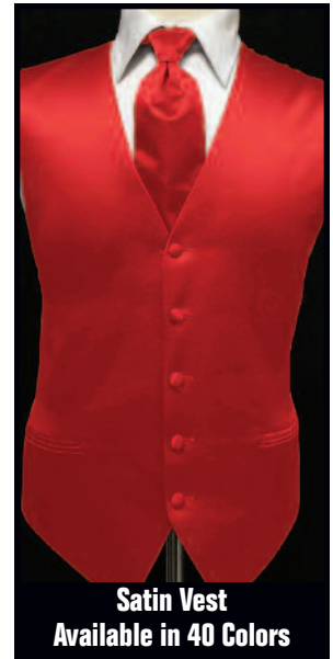
Satin Vest Available in 40 Colors