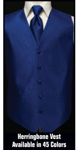
Herringbone Vest Available in 45 Colors